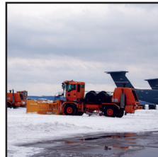
Snow plows clear the way for C-5s