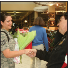
OSS reservist returns from deployment